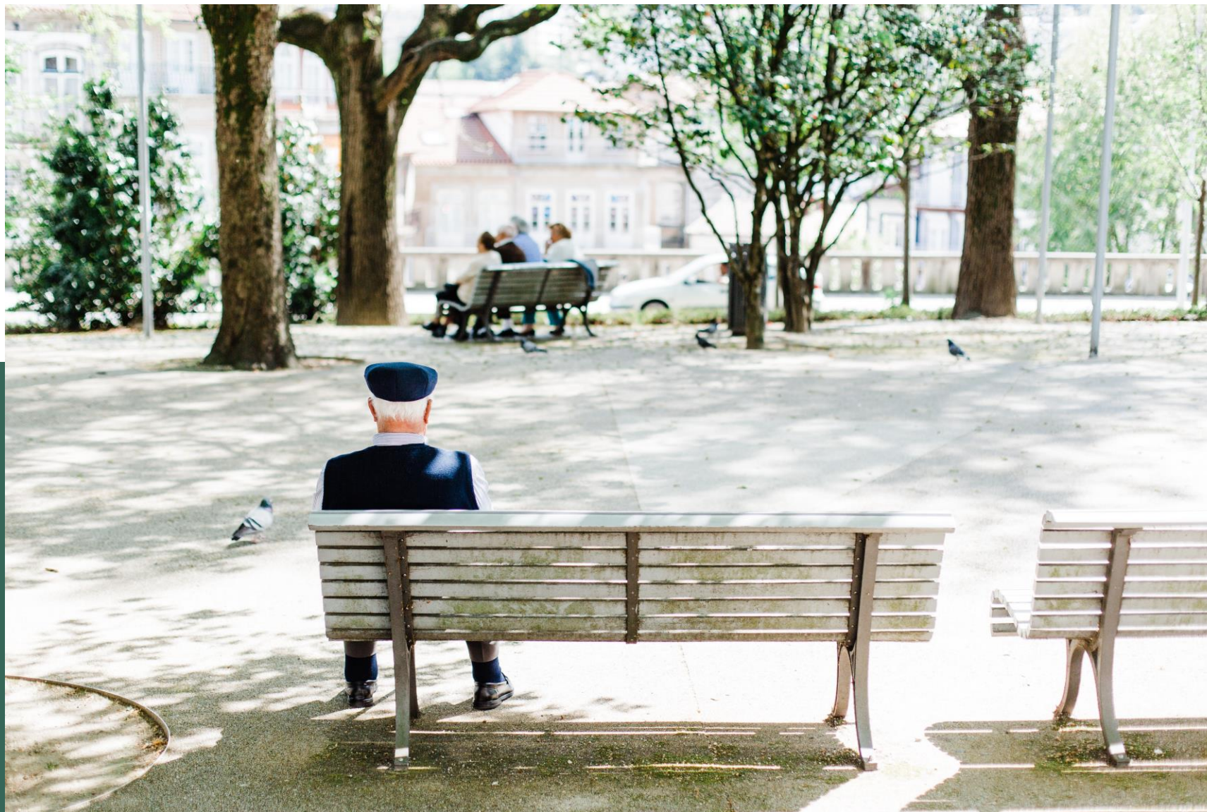
PORTO, ISCET June, 6th 2019